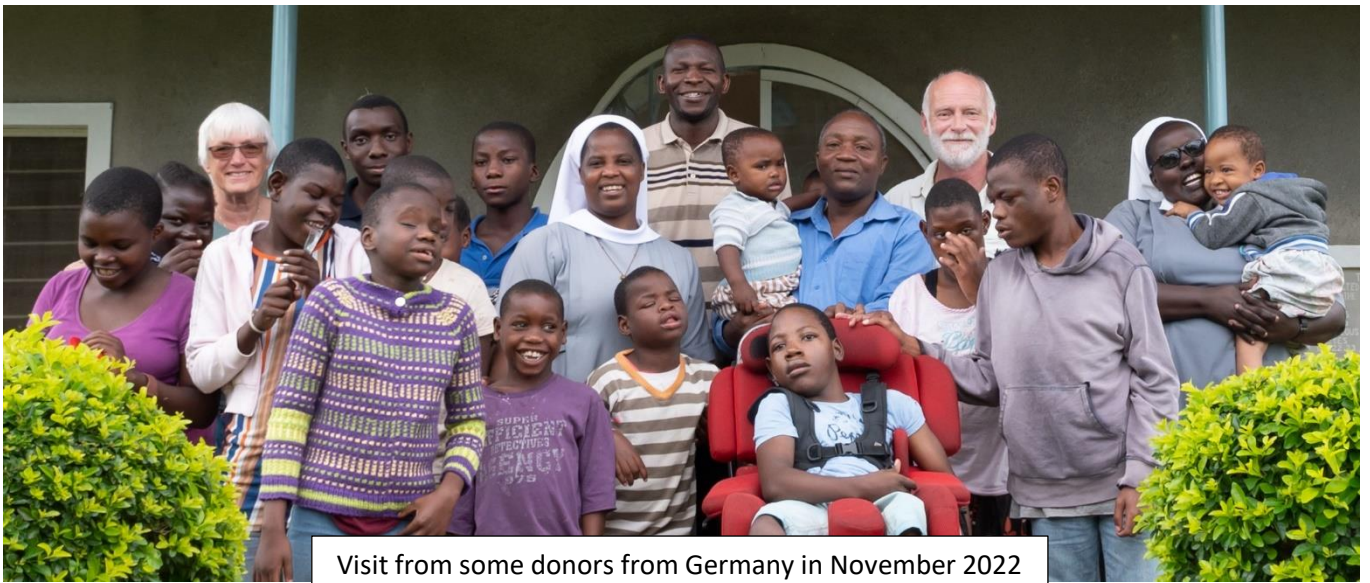
Visit from some donors from Germany in November 2022

We thank you with our whole hearts for your faithful continued support. All of us feel the effect of the inflation. In Tanzania too the prices have gone up rapidly. Thanks to your donations we can continue to give the children a home and a good education and we can pay their caregivers a salary that helps them to support their own families.