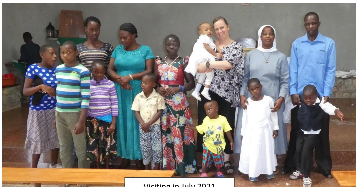
Visiting in July 2021