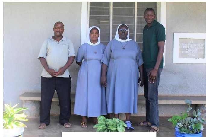
The leadership team

The leadership team has worked well together since I left a year ago. They send me reports and keep me informed. In July my two daughters and I were able to visit St. Nicholas and we were so happy to see that everyone is doing well and things continue the way they should even without my presence.