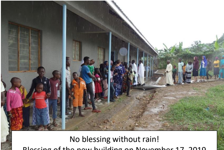
No blessing without rain! Blessing of the new building on November 17, 2019