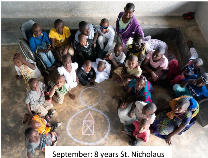
September: 8 years St. Nicholas

Ten children were baptized. Three children received their First Holy Communion. We celebrated the feast of St. Nicholas. In fact ever week we have another reason to celebrate: birthdays, the arrival and the farewell of visitors and volunteers, church celebrations, school graduations.... Therefore this is just a quick review in pictures of all the times we are celebrating: