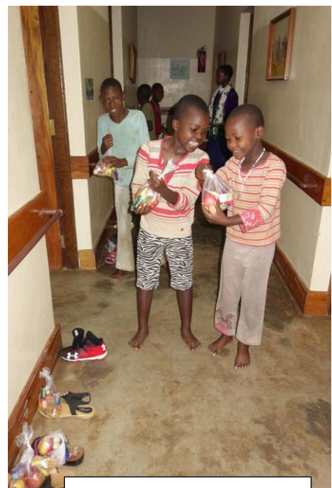
Celebrating St. Nicholas