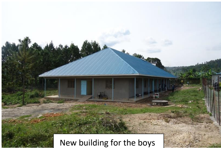
New building for the boys