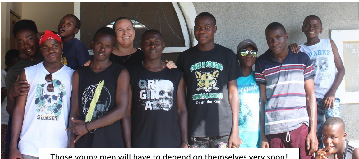
Those young men will have to depend on themselves very soon!

We are looking for sponsors for our new children! We are always grateful when sponsors support us on a regular basis because since the beginning of the pandemic we have received less donations. Also the children are happy when they know that someone cares about them and prays for them.