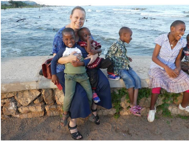
Enjoying the beach and having French fries and soda!