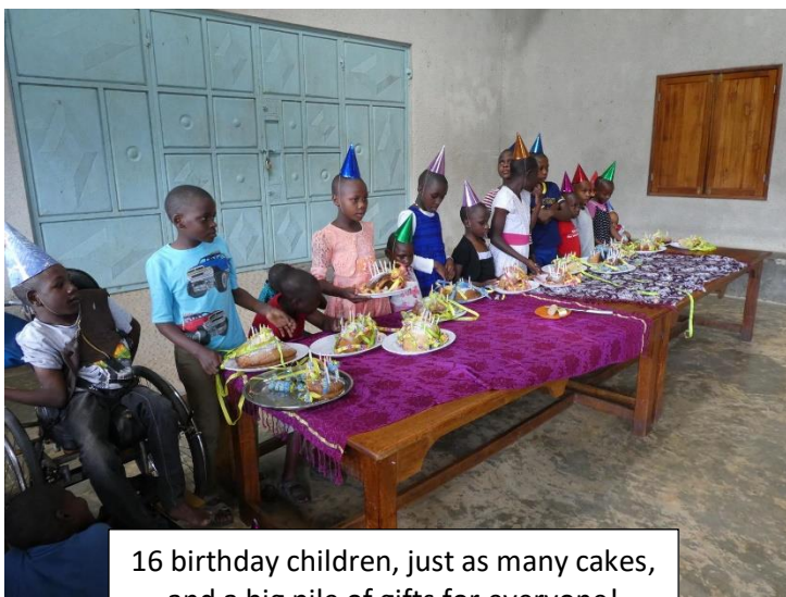
16 birthday children, just as many cakes, and a big pile of gifts for everyone!

However, when traveling to Tanzania we had to follow strict guidelines: We had to get a PCR-test before leaving Germany, register on a Tanzanian website prior to arrival in the country and get a rapid test at the airport upon arrival. On our return trip we needed to get another PCR-test and show the negative results five times before being allowed to leave the country.