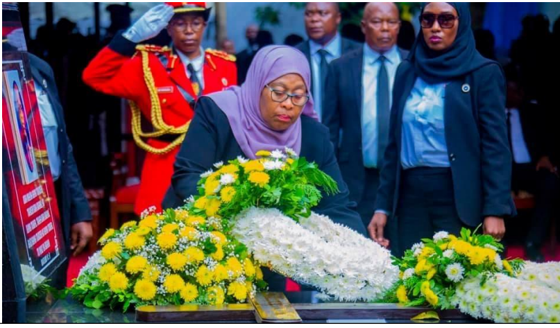
Tanzania's new President Samia Suluhu Hassan paying her respects at the funeral of late President Magufuli on March 26, 2021

The president was very popular in Tanzania. Foreign press was more critical of him. The vice president Samia Suluhu Hassan has been sworn in as the new leader of the country. So far the country has remained peaceful. If you want to read more about the current situation in Tanzania, I would like to refer to the following newspaper links: