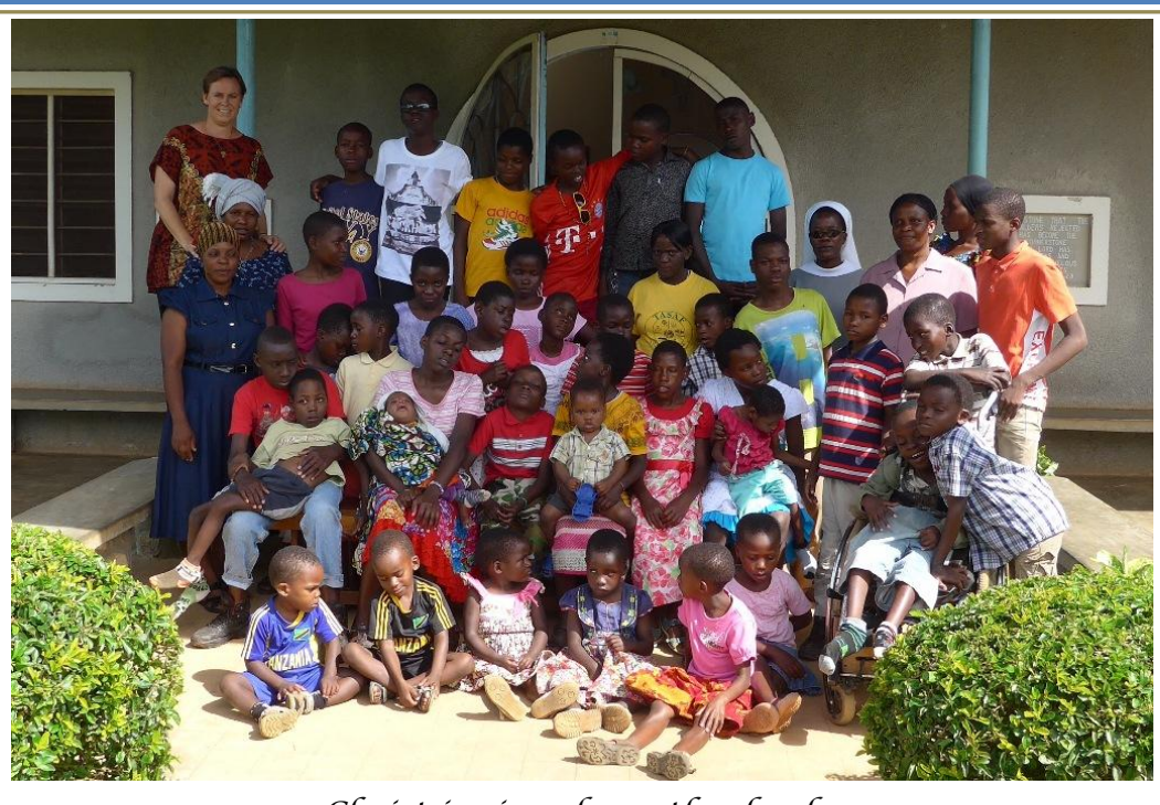
Christ is risen from the dead,

Phone: +255 756 751 605 E-Mail: <u>SEKoester@t-online.de</u> Webseite: www.nikolaushaus.com