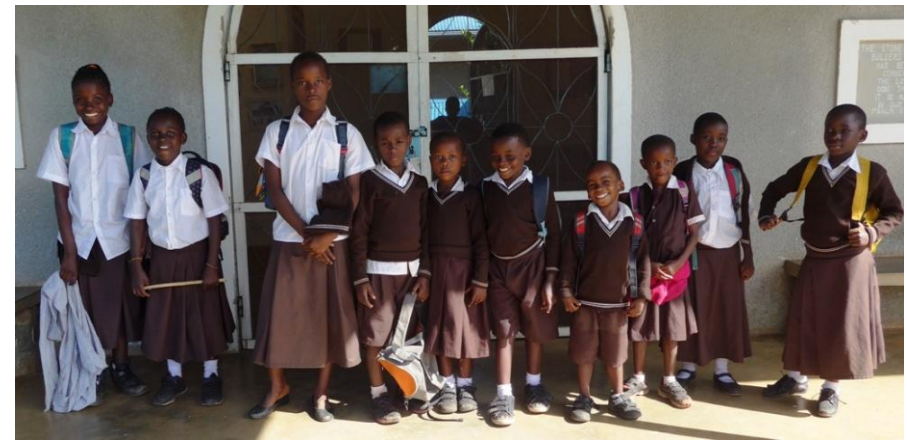
Proud School Children

schools, about having to get up so early, to study so much and they are cleaning out our food dishes as if they had nothing to eat since Christmas!