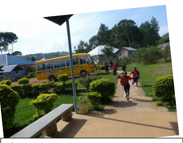
Our children are coming with the school bus!

31 children are attending 11 different schools. This is quite a challenge to cope with, especially at the beginning of the school year and during school holidays when I have to take all the children to their schools, to pick them up for the holidays and to pay for their school fees. I am using lists so I do not confuse any of the children and their schools! Right now all the children are home enjoying a few days off for Easter. They are talking about their different boarding